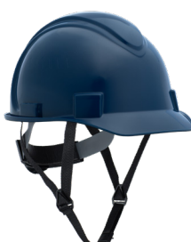
Dark Blue NSB20071