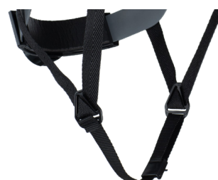
Chin Strap NSB200CS