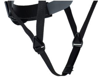
Chin Strap NSB200CS