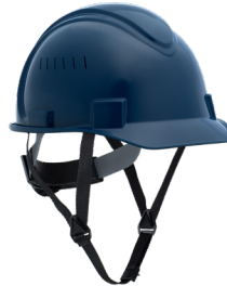
Dark Blue NSB21071