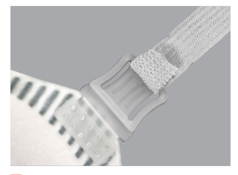
4-POINT ADJUSTABLE STRAPS Metal free, 4-point adjustable straps create a firm and adaptable fit.

FOAM PADDED NOSE BRIDGE A mouldable nose bridge and 360° foam area around the inside provide comfort and a firmer fit.