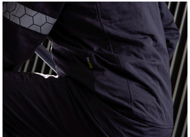
More comfortable during high-intensity activities