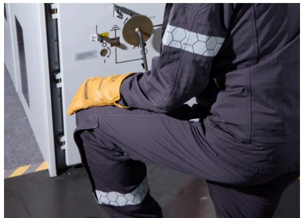
Increased ease of motion with less muscular fatigue