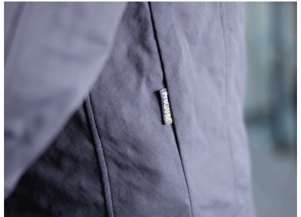
Lightweight GORE-TEX® fabric technology