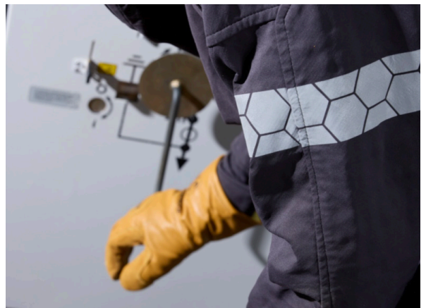
Increased ease of motion with less muscular fatigue