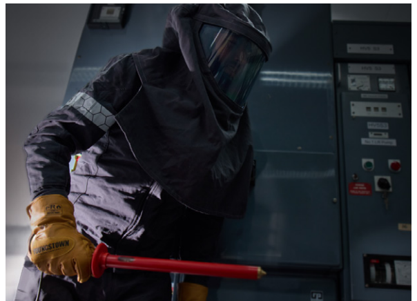
More comfortable during high-intensity activities