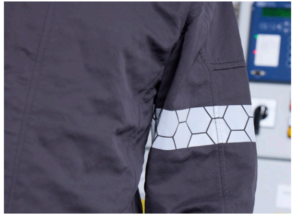
Lightweight GORE-TEX® fabric technology