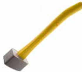
#306-00 Head 2.75" w x 1.75" h, plastic ergonomic handle 11.5" long, durometer 67-73 Shore 00