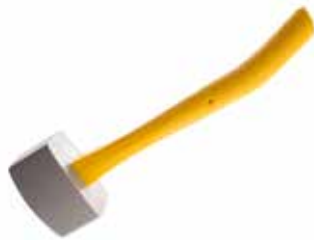
#300-00 Head is 2.5" w x 2.3" d x 4" h, plastic ergonomic handle 11.5" long, durometer 67-73 Shore 00