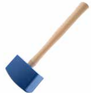
#ERSM Blue Sorbothane® VEP Head 2.5" w x 2.3" d x 4" h, straight wooden handle 10.2" long, 12 oz weight 70±5 Shore 00

Visco-elastic polymer VEP is custom molded and specified by engineers worldwide for its superior damping and isolation properties and scientifically proven to be the finest cushioning material available. In many applications and laboratory tests Sorbothane has achieved shock absorption levels of up to 94.7%. Unprecedented absorption levels are possible because VEP maintains stability and damping over a broad temperature range, enabling it to isolate damaging vibrations and impact shock in varied conditions. Its near faultless memory ensures a return to original shape, even after repeated compressions, making VEP ideal for a variety of engineering design applications requiring shock absorption, vibration isolation and acoustical damping.