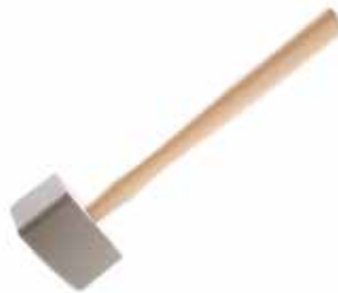
#305-00 Head 2.75" w x 1.75" h, wood straight handle 9" long, durometer 67-73 Shore 00