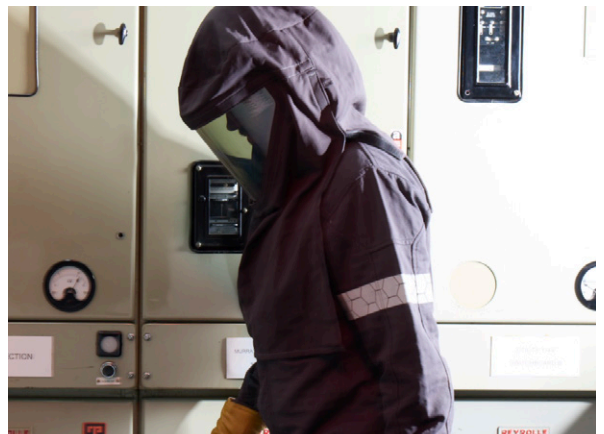
Advanced moisture management keeps workers cool