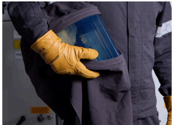
Up to 20% lighter than most other helmets