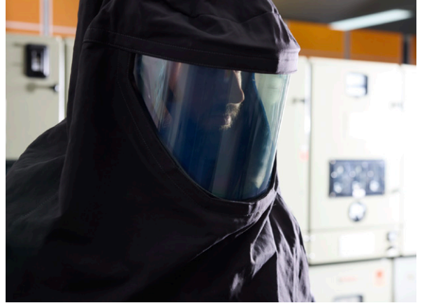
Anti-fog coated Arc Flash protective shield