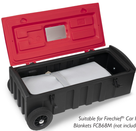
Suitable for Firechief® Car Fire Blankets FCB68M (not included)