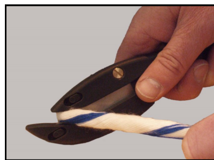
Rope (up to 12mm)