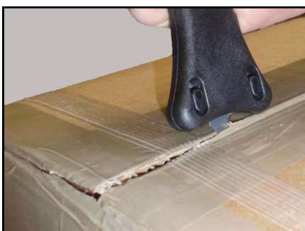
Tape & Card