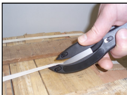
Strapping / Banding / Cable Ties