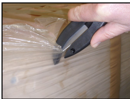
Stretch / Shrink / Bubble Wrap