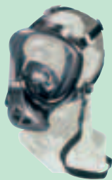
Ultra Elite-EZ D2056770