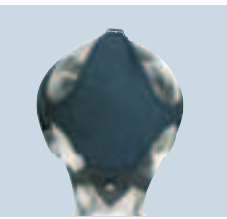
EZ [Easy-Don] Nomex harness