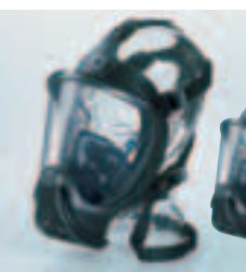
Available in standard and small sizes