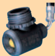
LA 96-N D4075852