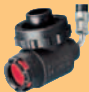
LA 96-AS D4075850