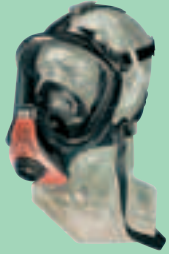
Ultra Elite-PS D2056751

Full face masks for two-way breathing with MSA Plug connector. For compressed air breathing apparatus with suitable positive pressure lung governed demand valve.