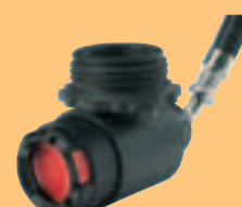
LA 96-AE D4075851