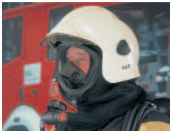
Masks for Mask- Helmet-Combinations [MSA GALLET]