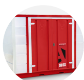
Forma-Stor COSHH FR300-C