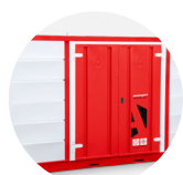
Forma-Stor COSHH FR400-C