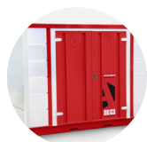
Forma-Stor COSHH FR300-C