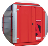
Forma-Stor COSHH FR200-C