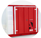
Forma-Stor COSHH FR300-C