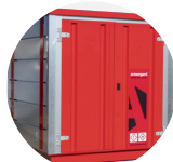
Forma-Stor COSHH FR200-C