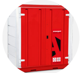
Forma-Stor COSHH FR100-C