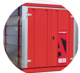
Forma-Stor COSHH FR200-C