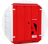
Forma-Stor COSHH FR100-C