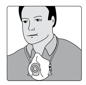
6. Let mask hang around your neck.