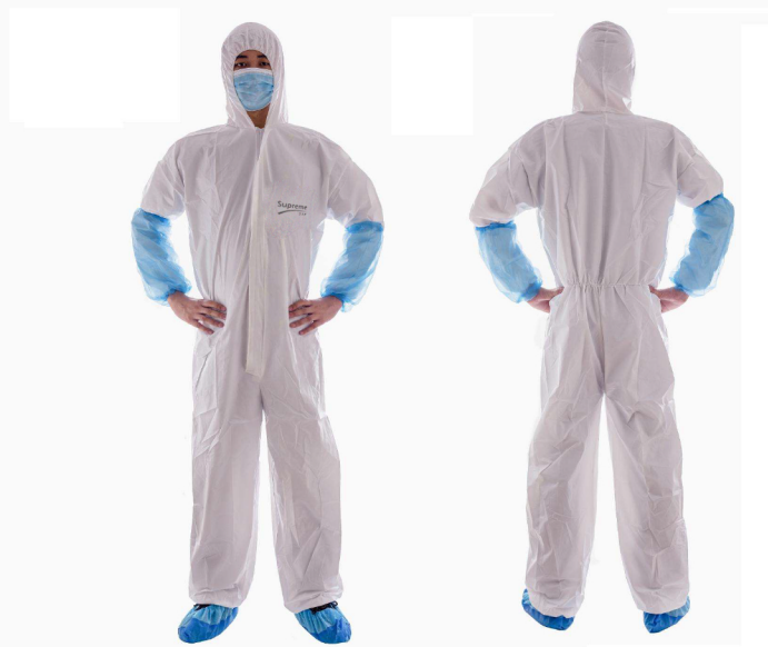
*Face mask, shoe/sleeve covers not included.