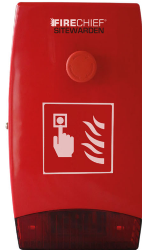
FIRECHIEF SITWARDEN SE PUSH BUTTON ALARM