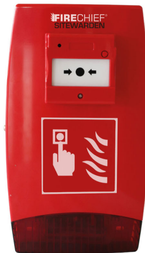
FIRECHIEF SITWARDEN SE CALL POINT ALARM