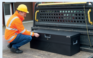
For extra security in vans or in the workplace