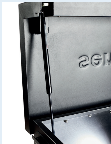
Twin hydraulic arms