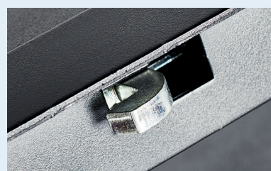
4 Point patented locking system 2 Horizontal tongues 2 Vertical hooks