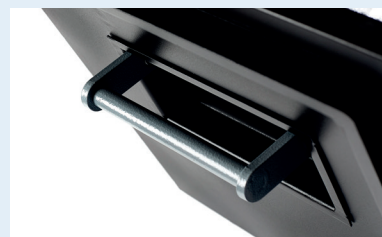
Drop down handles for safety Anti-jemmy bars extra security