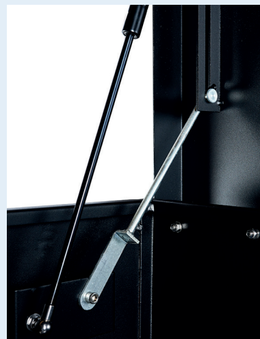
Mechanical stay for additional safety Twin hydraulic arms