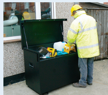
For extra security in vans or in the workplace