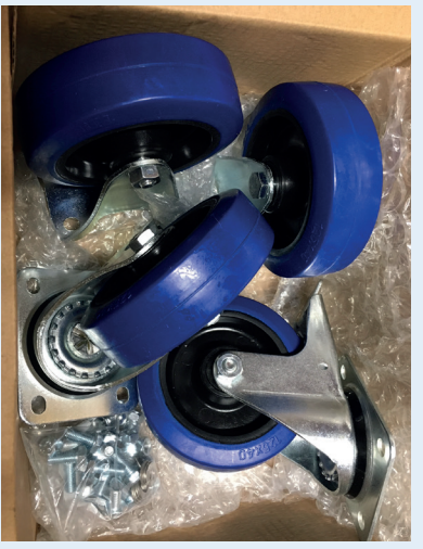
Full fixing kit included