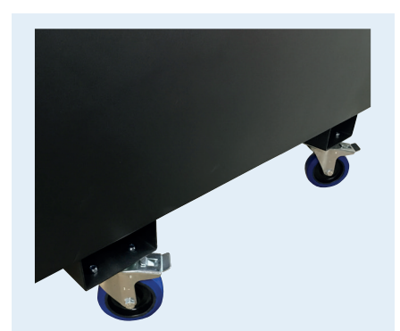
UK tested 550kg per box