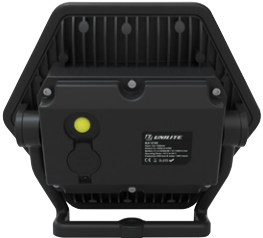
USB POWER BANK FACILITY