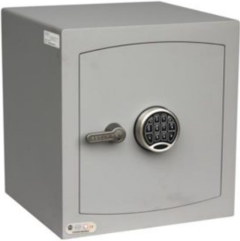
Mini Vault 3 S2 Silver Electronic Locking