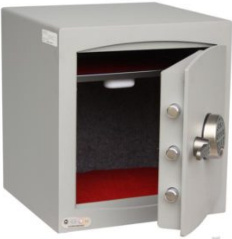
Mini Vault 3 S2 Silver Electronic Locking