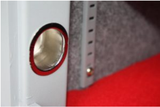
Mini Vault Chrome Bolt Cup