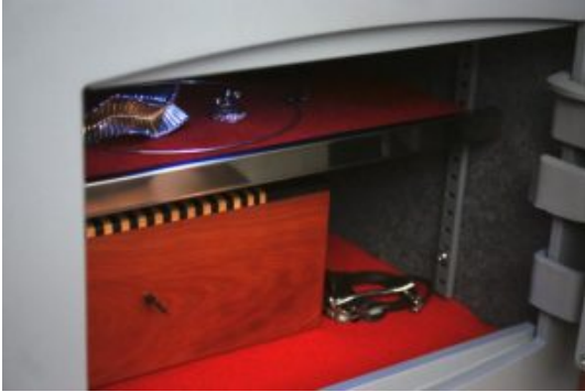
Mini Vault Jewellery Shelf