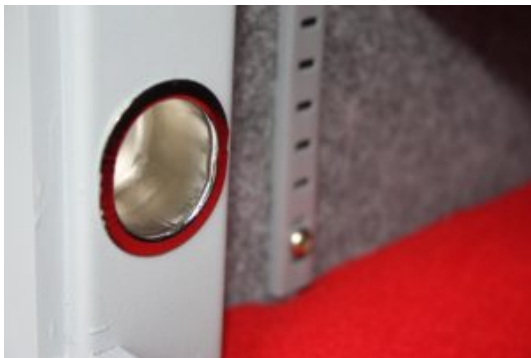
Mini Vault Chrome Bolt Cup