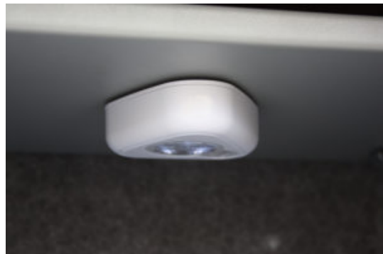
Motion Activated Magnetic Light