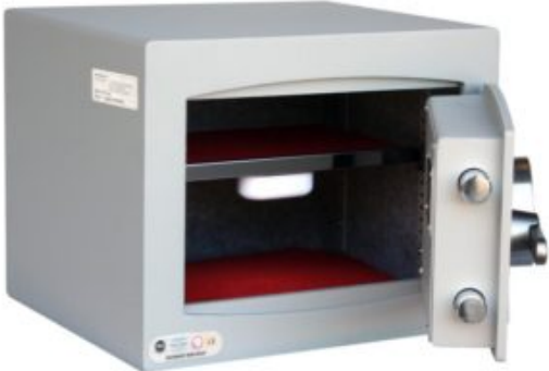
Mini Vault 1 S2 Silver Electronic Locking