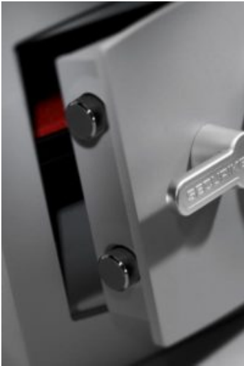
Mini Vault Bolts & Handle