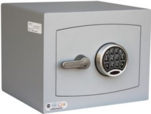
Mini Vault 1 S2 Silver Electronic Locking