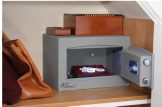
Mini Vault 0 S2