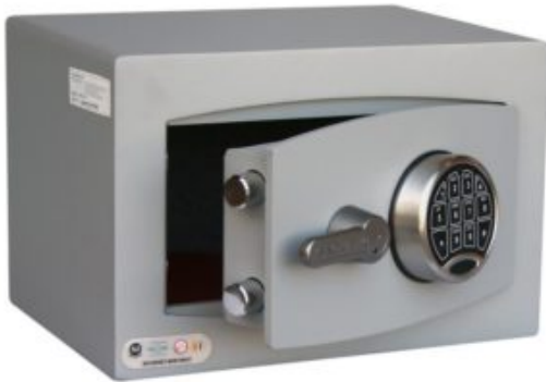
Mini Vault 0 S2 Silver Electronic Locking