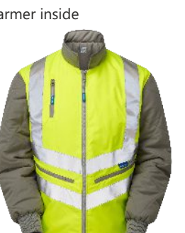
4 Sleeved Body Warmer