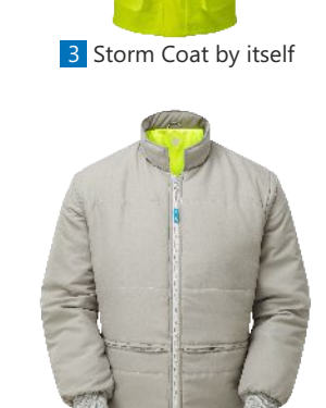
5 Sleeved Body Warmer Reversed