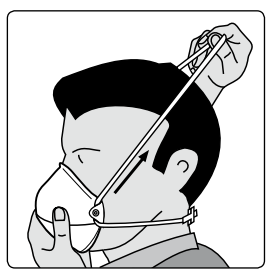
4. Pull upper strap and place on back of head.