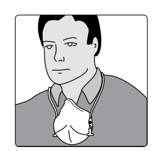
6. Let mask hang around your neck.