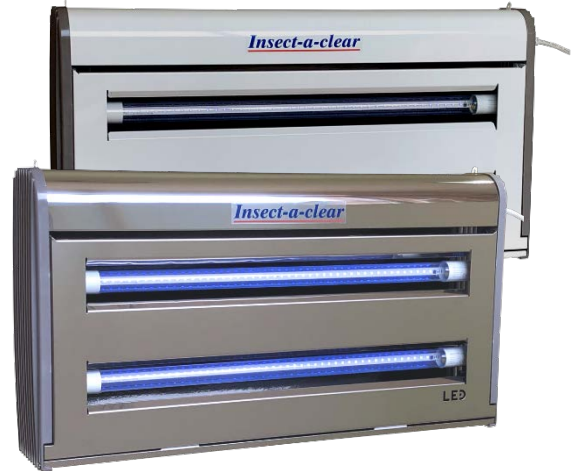
Actual size W 65 x H 35.5 x D 12 cm

stainless steel, make this a very popular model