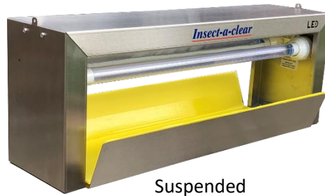
Suspended Actual size W=660 H=245 D=245

There are two models of the Insect-a-clear GLU-80 machine, suspended and wall mounted. The suspended model uses 2, 5w high output LED lamps and the wall mounded version, one. The flying insects are attracted by the high output LED UV lamps. These lamps have their starters built into the lamp. When changing the lamp, you get a 'new' machine unlike other models where the control gear will require changing at some time. Removing the glue board is quick and easy and once removed, monitoring by a pest controller or hygiene manager is easily undertaken. Conforms to IP65 for water and dust protection. Screws and wall plugs or chain is supplied.