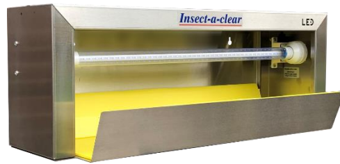
Wall mounted Actual size W=660 H=245 D=245