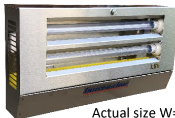
Actual size W=510mm H=265 D=100