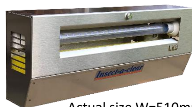
Actual size W=510mm H=190 D=100