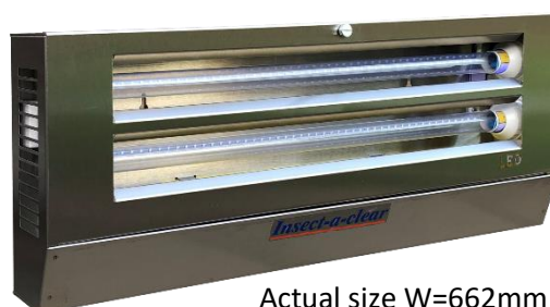
Actual size W=662mm H=265 D=100