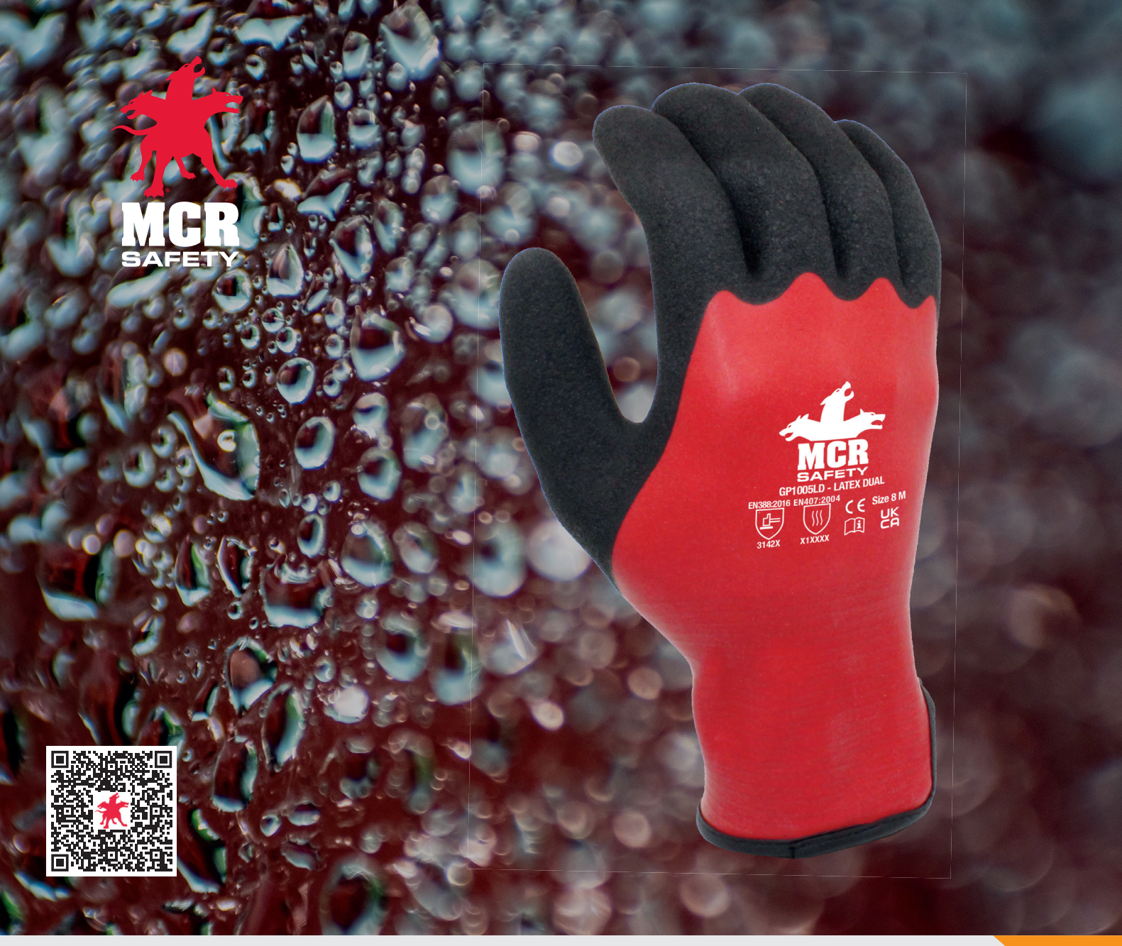
GP1005LD • Fine Nylon • Double Dip Latex

The ultimate glove for working in damp environments, with all day comfort, flexibility and breathability in a double dip latex coating.