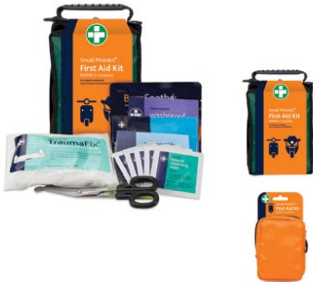
Also available in Orange Borsa Bag.