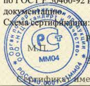
Схема сертификации: 3.

ДОПОЛНИТЕЛЬНАЯ ИНФОРМАЦИЯ Место нанесения знака соответствия: знак соответствия по ГОСТ Р 50460-92 наносится на ярлыки изделия и (или) в товаросопроводительную документацию