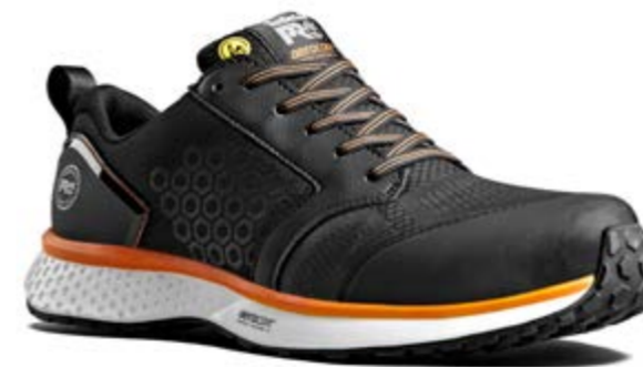
A1YUW 001 COMPOSITE SAFETY TOE Black/Orange