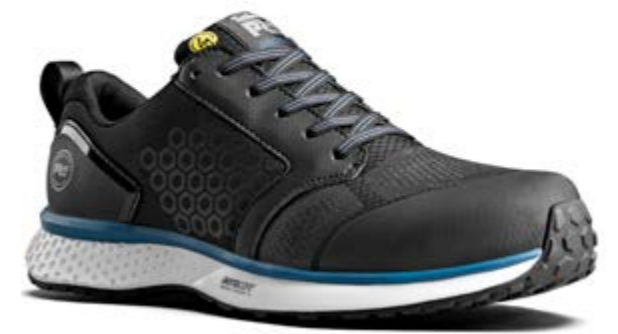
A1ZKQ 001 COMPOSITE SAFETY TOE Black/Blue