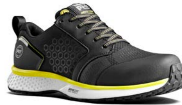
A1YUA 001 COMPOSITE SAFETY TOE Black/Yellow