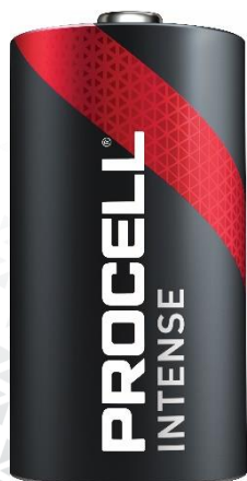
Size: D (LR20) PX1300