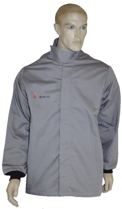
Jacket. CLY 574 048