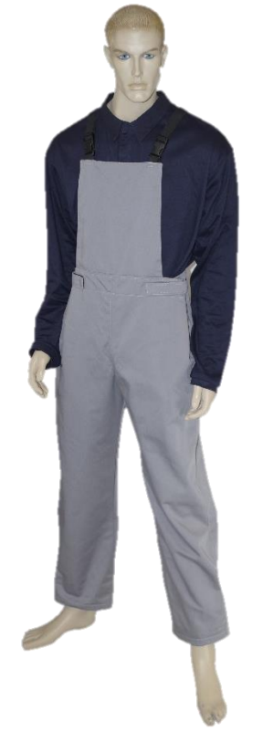
o Bib overall. CLY 573 048