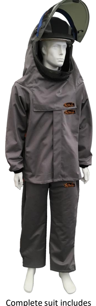
Complete suit includes hood, gloves and storage bag. CLY 576 048