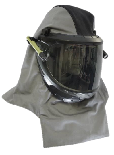
o Hood. CLY 571 048 SRH