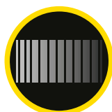
PART ELASTICATED WAIST