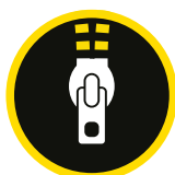
YKK MAIN ZIP LIFE TIME WARRANTY