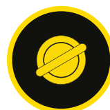
NON-SCRATCH HEAVY DUTY FIXING STUD