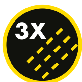
TRIPLE STITCHED SEAMS