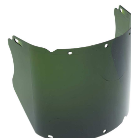
10115862 - Shade 5 visor for chin protector