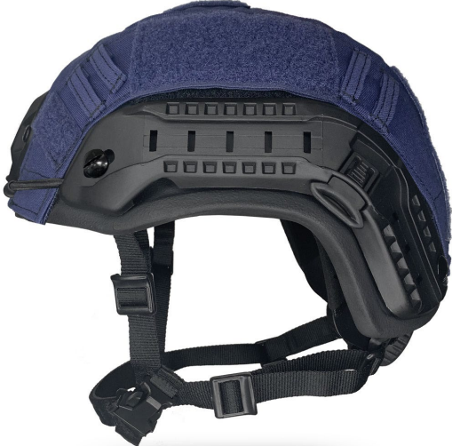
HIGH CUT SIDE VIEW WITH COVER