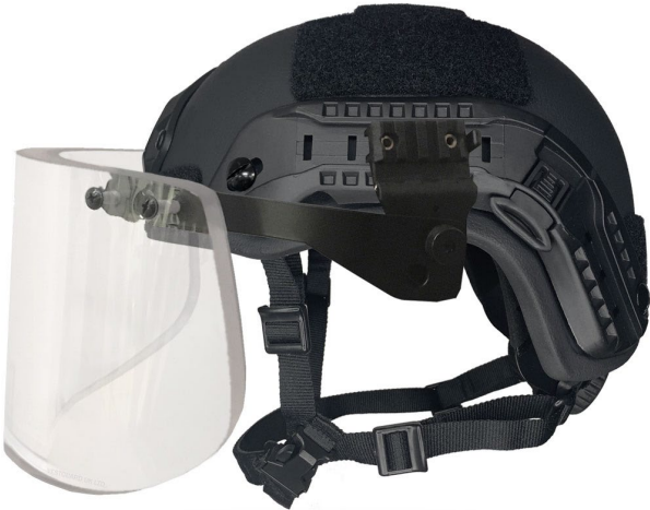
HIGH CUT SIDE VIEW WITH BALLISTIC VISOR