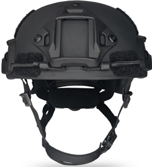
HIGH CUT FRONT VIEW