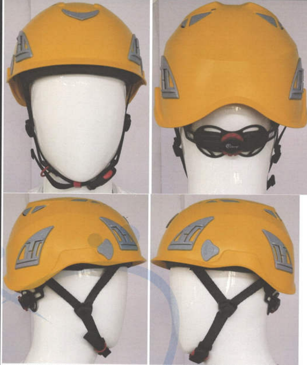
STARLINE 1480 (Blue, White, Red, Orange, Yellow, Green, Pink, Grey and Black)