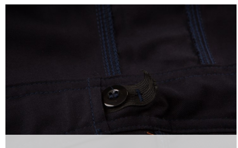
Internal elasticated waistband for improved fit

Colourfast with less than 3% washing shrinkage