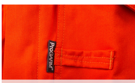
Radio loop on chest pocket