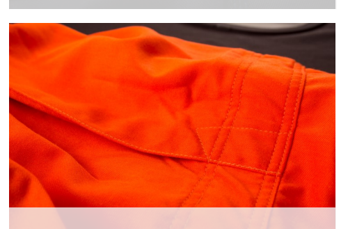
Internal kneepad pocket