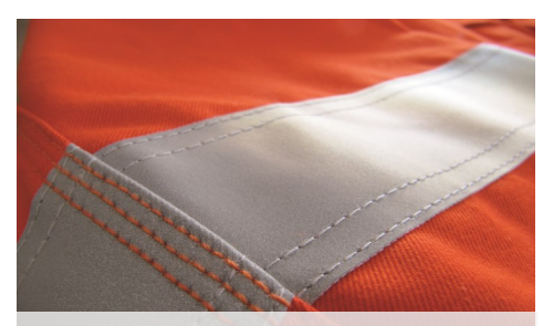
Double stitched ThermSAFE reflective tape for longevity

Colourfast with less than 3% washing shrinkage