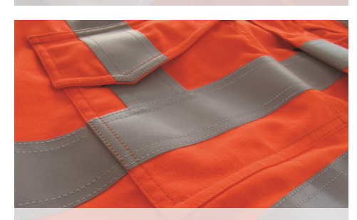
GO/RT tape pattern for trackside workers