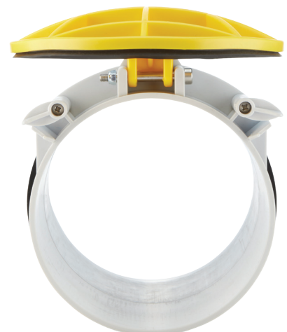
NRV150 for DN150 pipe inlets