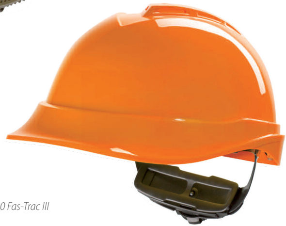
V-Gard 200 Fas-Trac III