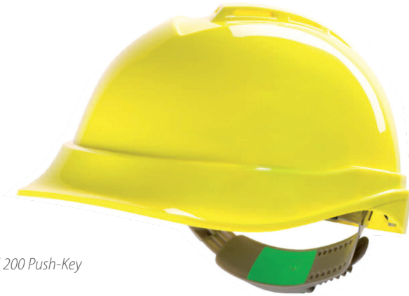
V-Gard 200 Push-Key