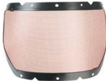
10155775- Mesh Visor for chin protection