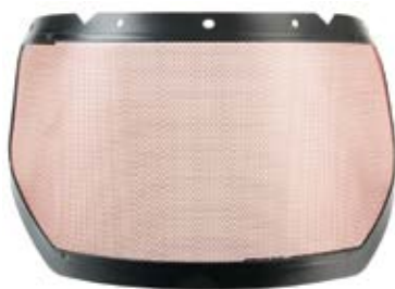
10155774- Mesh Visor below shown with visor frame