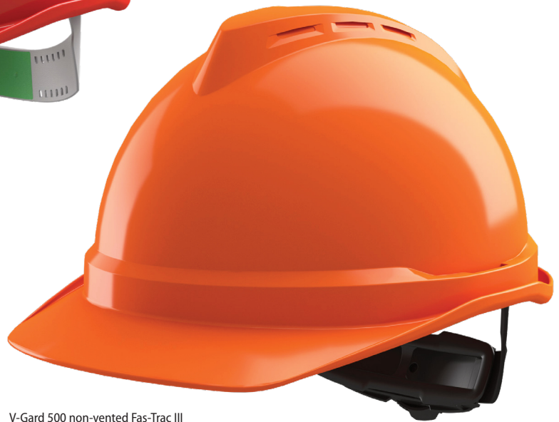
V-Gard 500 non-vented Fas-Trac III