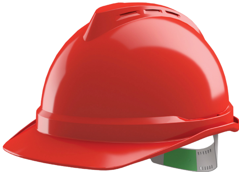
V-Gard 500 non-vented Push-Key