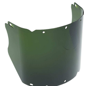
10115862 - Shade 5 visor for chin protector