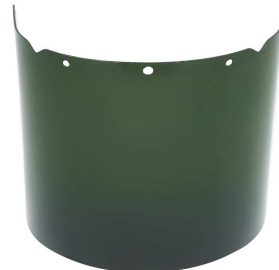
10115861 - Shade 5 visor