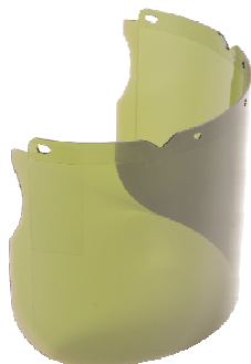
10115859 - Shade 3 visor